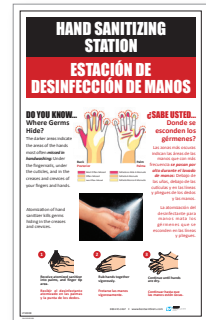
Laminated Bilingual Instructional Hand Sanitizing Poster LT10008

*One gallon secondary containers also available