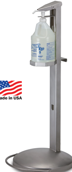
EZ-Step Portable Foot-Activated Dispenser MD10012