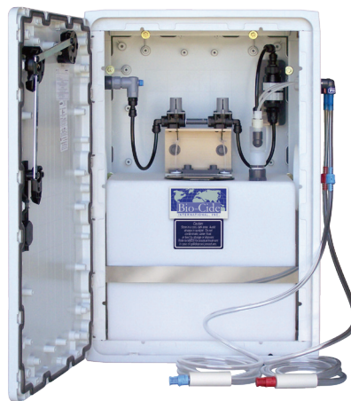
Wall Mount Activation System ™