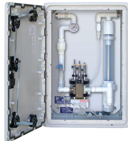
OLAS ™ Ti